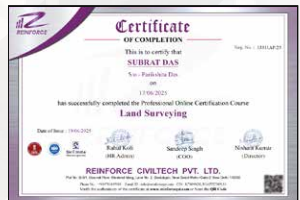
Assessment & Certification